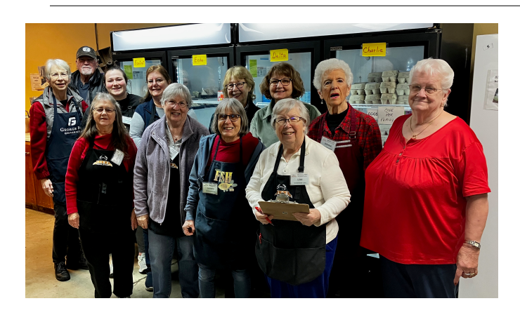
Monday Office and Warehouse Workers