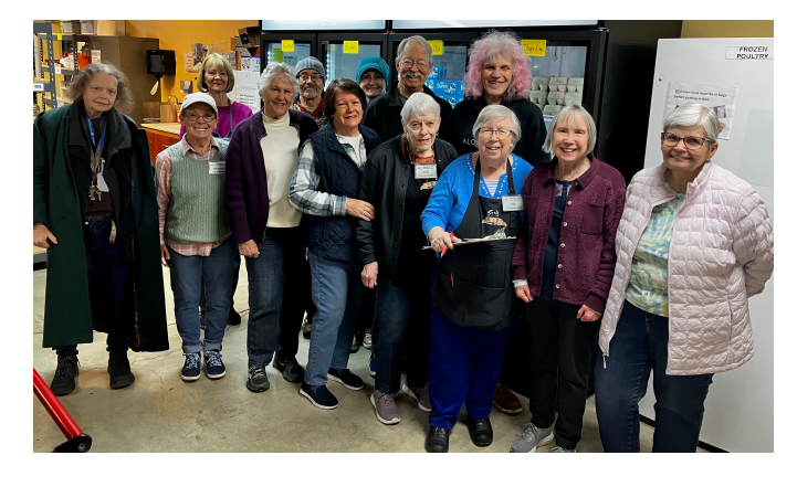
Tuesday Office and Warehouse Workers